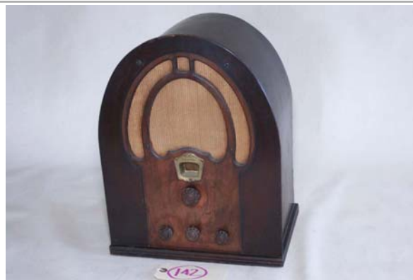
142. Philco / 60B 1935/1936; Broadcast; Cathedral; Superhet; 5-tube