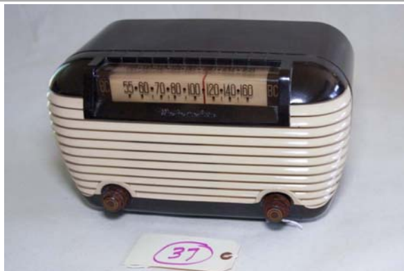
37. Motorola / 67X AM set; 1947; 5-tube; Bakelite case; Coleman