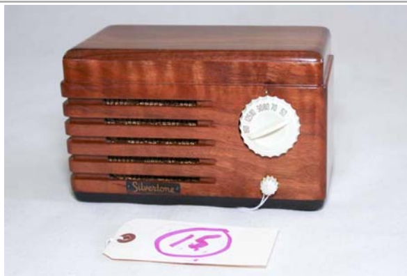
15. Silvertone / 109.199-1 AM set; 1940's; wood case; Coleman