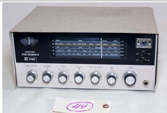
44. Knight / Star Roamer II Solid-State Shortwave Receiver