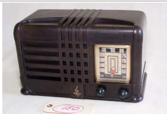
150. Emerson / model? AM set; circa 1941; 5-tube; Bakelite case; Coleman