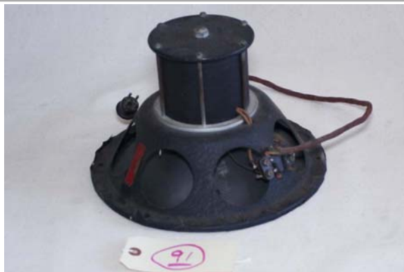
91. Atwater Kent / Type 7-4 Speaker; cone has small hole; Field and Voice coils have continuity