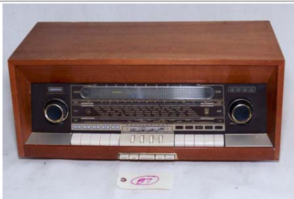
87. Grundig / 6199 LW/MW/SW plus FM; Stereo; mfd in Germany