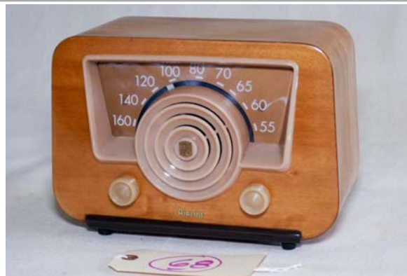
68. Airline / 84BR-1815B AM set; Wood case; circa 1949; 5-tube; Coleman