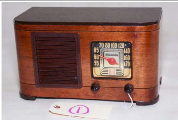
1. Motorola / 51X19 AM set; Pre-war; wood case; 5-tube; Coleman