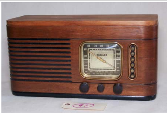
97. Remler / 179 AM set; circa 1938; 6-tube; push buttons