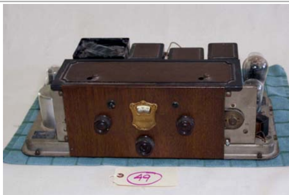
49. Atwater Kent / 55C TRF; 1929; Chassis only - has tubes