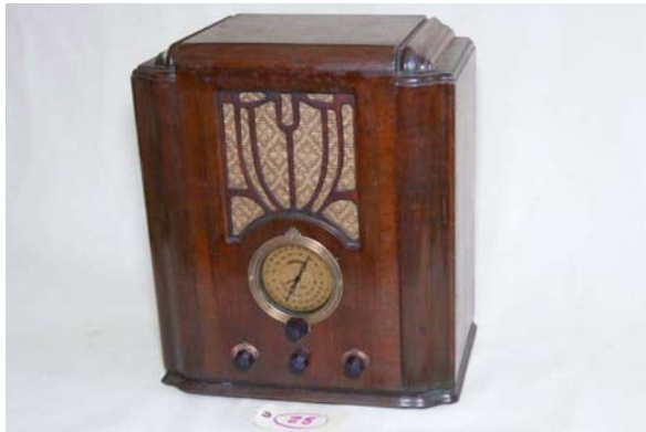
25. Crosley / 1014 Centurion LW/BC/SW; 10-tube