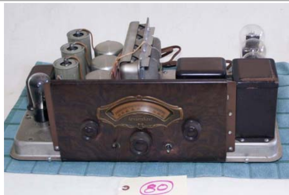
80. Atwater Kent / Type L TRF; 1930; Chassis only