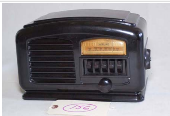
156. Airline / 04BR-513B AM set; 1940; 5-tube; Bakelite case; Coleman