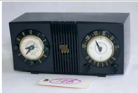
128. Motorola / 51C AM clock radio; circa 1954 ; 5-tube; Coleman