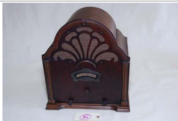
36. Apex / 8A TRF; 1931; Cathedral Radio; 8-tube