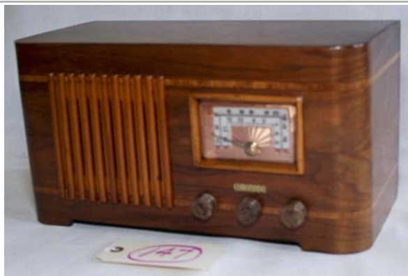
147. Coronado / 906 AM set; circa 1941; 6-tube; Coleman