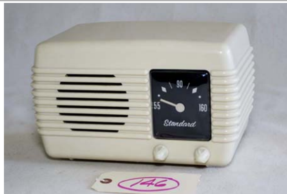
146. Standard / model? AM set; 5-tube; Coleman