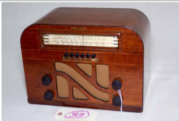
33. Philco / 40-145 BC/SW; 1940; push buttons; 6-tube; Coleman