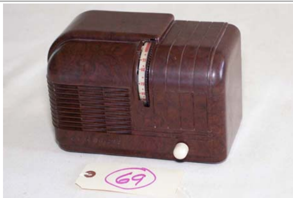
69. General Electric / H500 AM set; 1939; 5-tube; Machine Age styling; Coleman