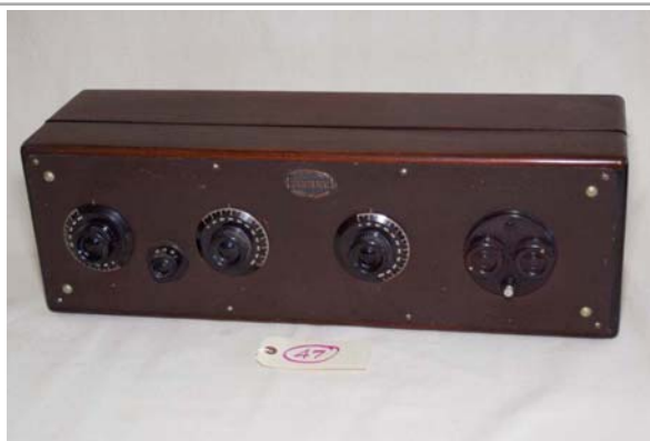
47. Atwater Kent / 20 TRF; 1924; has tubes and operating manual