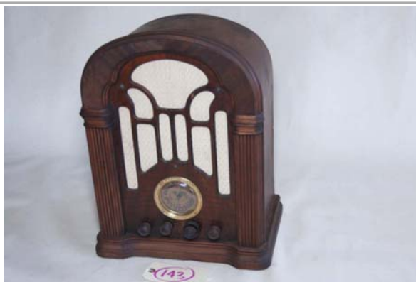
143. Atwater Kent / 206 1934; Broadcast; Superhet; 6-tube; prior owner says it plays