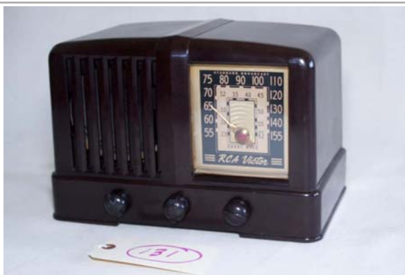
131. RCA Victor / 46X12 BC/SW; 1939; Coleman