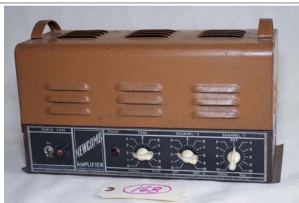
168. Newcomb / model? PA Amplifier; circa 1959