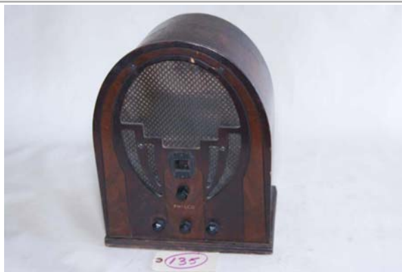
135. Philco / 60 & 505 1933/1934; BC/SW; Cathedral; Superhet; 5-tube