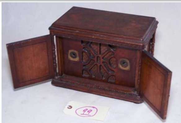
99. Emerson / 350AW 1933; Cabinet and knobs only