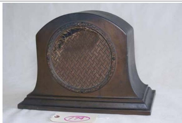
174. Radiola / 100A Speaker; case has no chips; has continuity - clicks with battery test