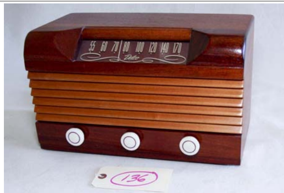
136. Delco / R1229 AM set; 1946/1947; 6-tube; Coleman