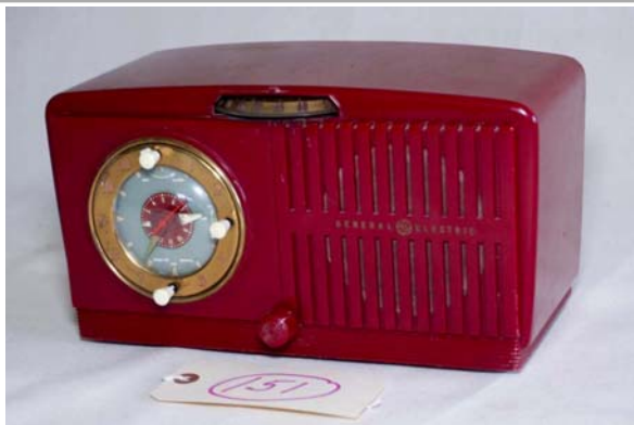
151. General Electric / 515F AM Clock Radio; 1951; 5-tube; Coleman