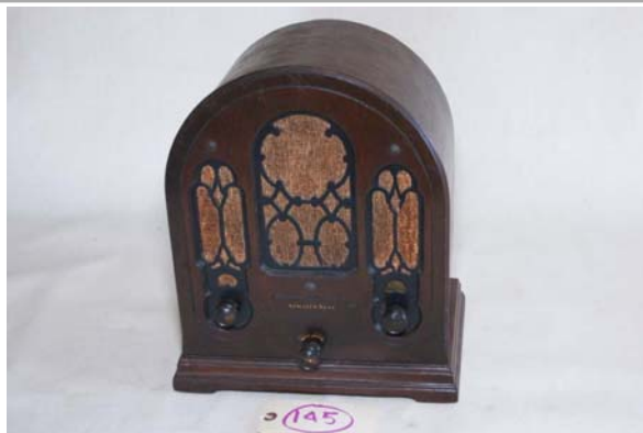
145. Atwater Kent / 165 1933; Broadcast; Cathedral; Superhet; 5-tube