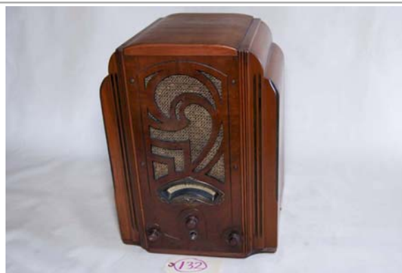
132. Stewart Warner / R1261A 1934; Broadcast; Tombstone; 7-tube