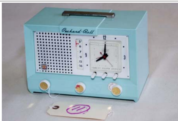
11. Packard Bell / 5RC4 AM Clock Radio; circa 1957; Turquoise; hairline crack on top of case; Coleman