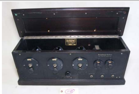
118. Stromberg Carlson / Neutrodyne TRF; circa 1924/1925; no tubes