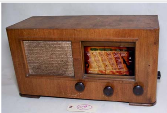
119. Sachsenwerk / Olympia 393WK LW/MW/SW; 1937/1938; 5-tube; mfd in Germany