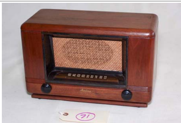
71. Airline / 84WG-1804D AM set; wood case; circa 1950; Coleman