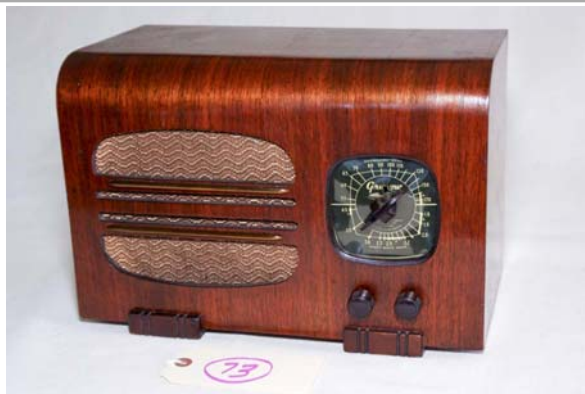
73. Grunow / 576 AM set; 1937; wood case; 5-tube