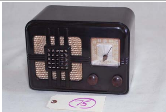
75. Knight / 63-275 AM set; Bakelite case; Coleman