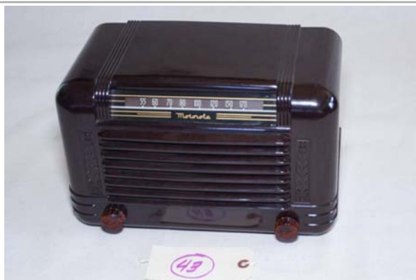
43. Motorola / 65X11-A AM set; 1946; 5-tube; Bakelite case; Coleman