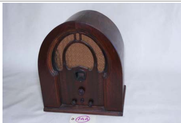
144. Philco / 71 1932/1933; Broadcast; Cathedral; Superhet; 7-tube