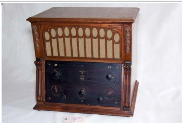
161. Radiola / X (i.e. 10) TRF; 1924; modified to use 864 tubes in place of WD199's; has tubes