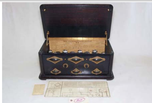
50. Grebe / MU-1 "Synchrophase" 1925; TRF; with chain; has tubes