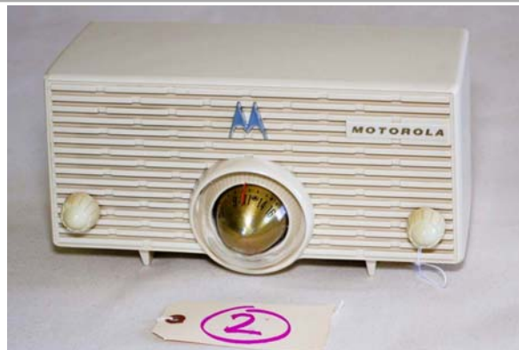
2. Motorola / 56H (White) AM set; circa 1955; 5-tube; unique "Bullet" dial; Coleman