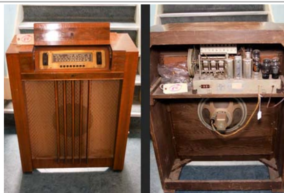
54. Philco / 39-45 BC/SW; 1939; 9-tube console with flip-up door