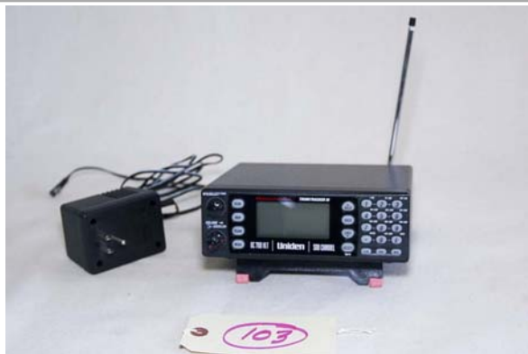
103. Uniden Bearcat / BC780HLT Trunk Tracker III; 500 Channel with power supply