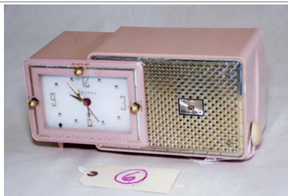
6. Bulova / 120 AM Clock Radio; 50's Pink & Gold; Coleman