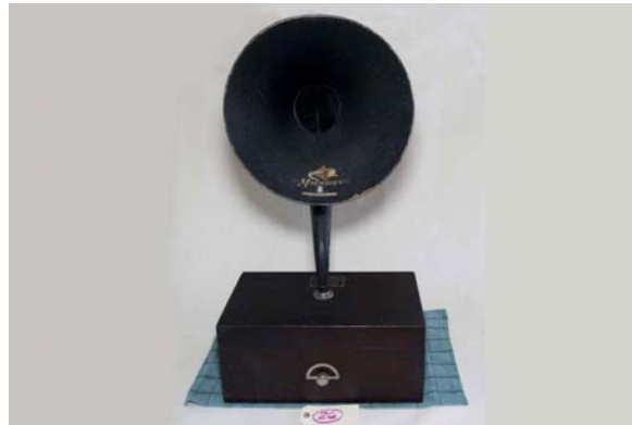
26. Magnavox / TR1A 1920's; Tele-Phonograph Horn Speaker