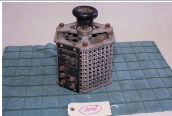
104. Powerstat / 1226 Variac