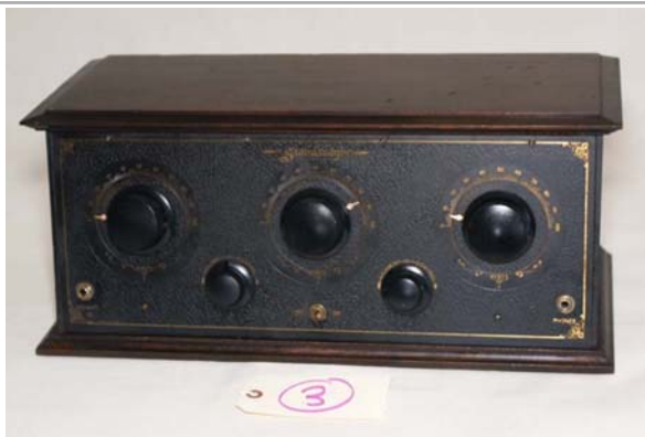
3. Standardyne / B5 or B6 TRF; 1925/1926; Distinctive Gold detail on face