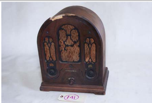
141. Atwater Kent / 165 1933; Broadcast; Cathedral; Superhet; 5-tube