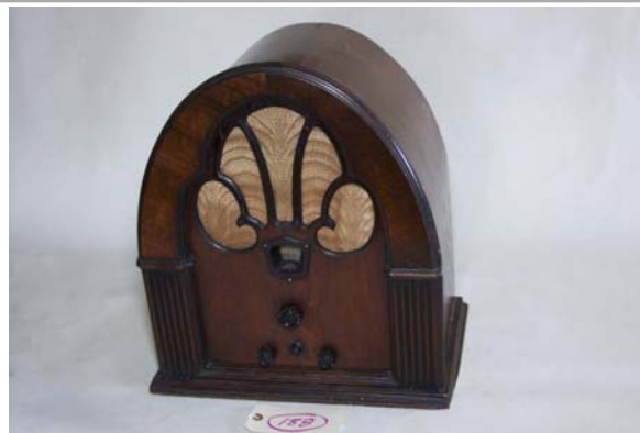
158. Philco / 70 "Baby Grand" 1931; Cathedral radio; Superhet; 7-tube; prior owner says plays great