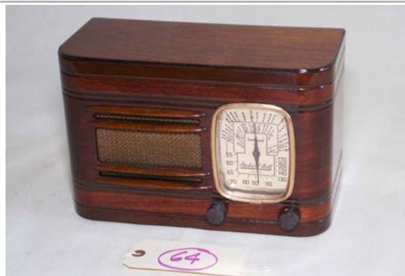
64. Packard Bell / 5T AM set; Pre-war; wood case; 5-tube; Coleman