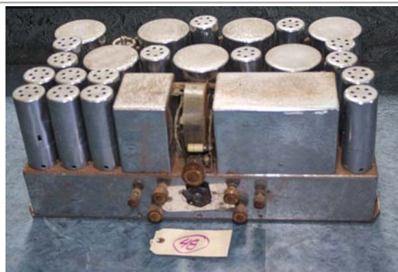
48. Scott / All-wave 15 Receiver chassis only