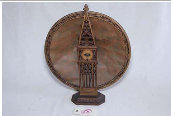
58. Pathe / Westminster Circa 1925 speaker; ALL ORIGINAL Start Bid: $150