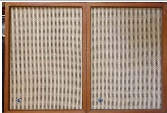
86. Audiovox / model? Speaker pair; tested in working order