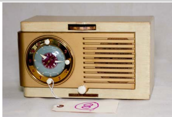
8. General Electric / 508 AM Clock Radio; 1950; Ivory & Gold; Coleman