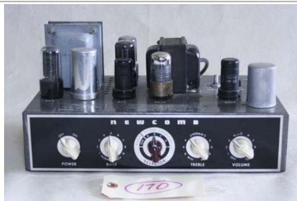
170. Newcomb / HLP14 PA Amplifier