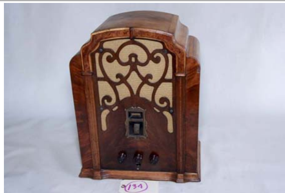
134. Zenith / 715 1933; Broadcast; Tombstone; Superhet; 8-tube