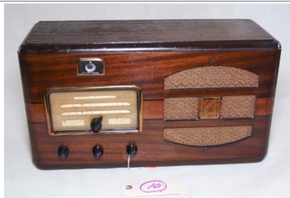
10. General Electric / F-74 AM/SW; 1938; 7-tube; wood case