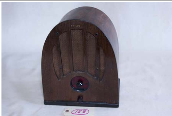
123. Philco / 37-84 1937; Broadcast; Cathedral; 4-tube; restored by prior owner