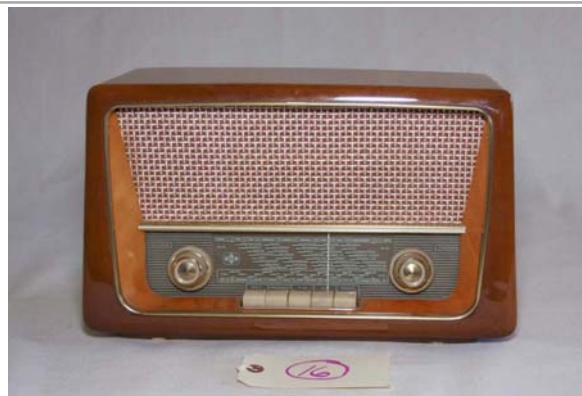
16. Emud / Rekord Junior 196 AM/FM; 1958; 6-tube; mfd in Germany