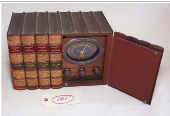
101. Majestic Radio / "Set of Books" AM set; Majestic radio mounted in an Emerson or Crosley "Set of Books" case