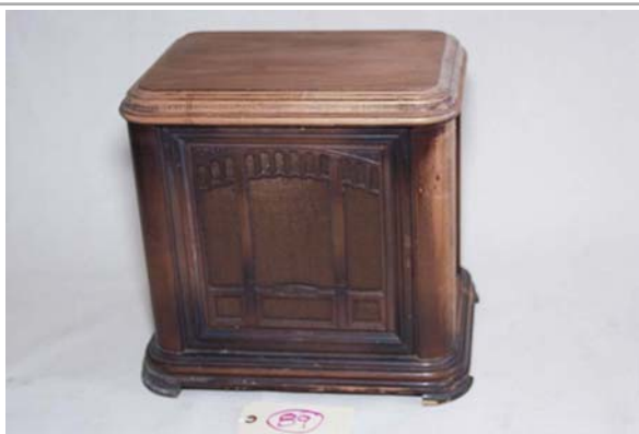
89. Jensen & Atwater Kent / model? Jensen cabinet has Atwater Kent Type N speaker; Field and voice coils have continuity