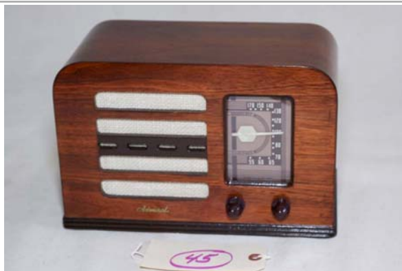
45. Admiral / 4220-D5 "Super Aeroscope" AM set; circa 1940; 5-tube; Coleman