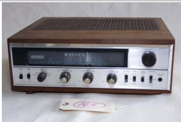
165. HH Scott / StereoMaster 344-B FM Stereo Tuner/Amplifier; solid-state; 85 watt; 1965/1966; not working