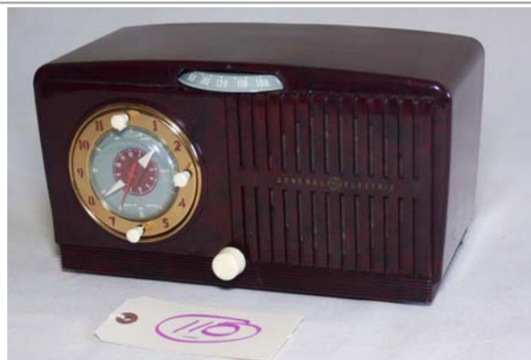
110. General Electric / 515F AM Clock Radio; 1951; 5-tube; Coleman