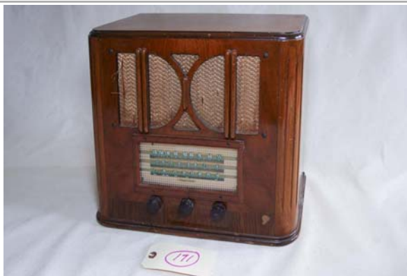
171. Truetone / D1022 BC/SW; 1941;