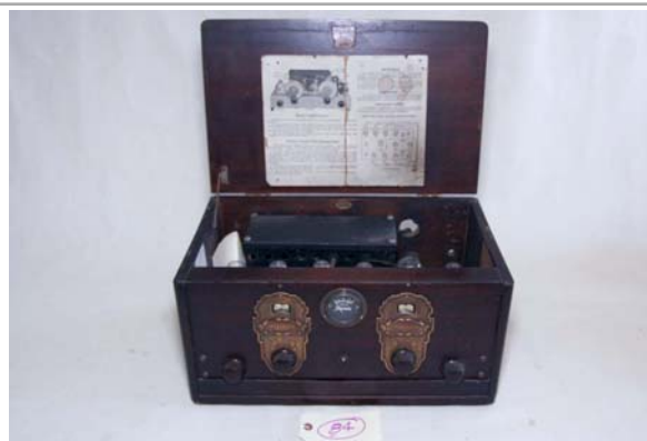
84. Steinite / 990 TRF; 1927; Brass escutcheons; volt meter; has tubes