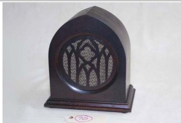
70. Peerless / model? 1920's Cathedral Speaker