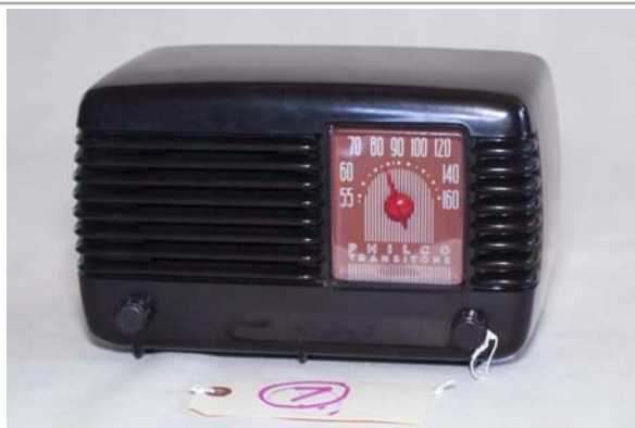
7. Philco Transitone / 48-200 AM set; 1948; 5-tube; Bakelite case; Coleman