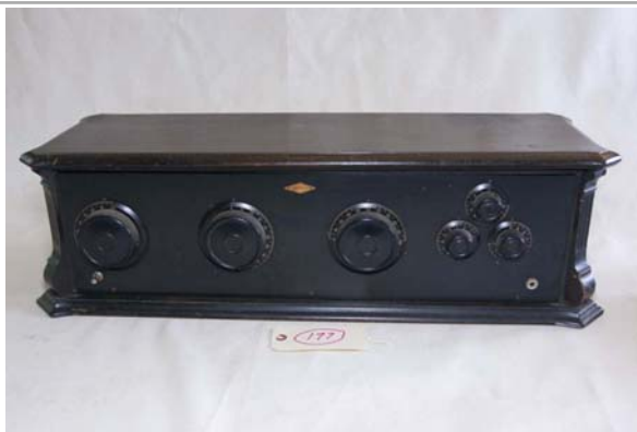
177. Splitdorf / model? TRF; circa 1924-1926; no tubes