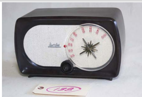
138. Arvin / 753T AM set; 1953/1954; 5-tube; Coleman