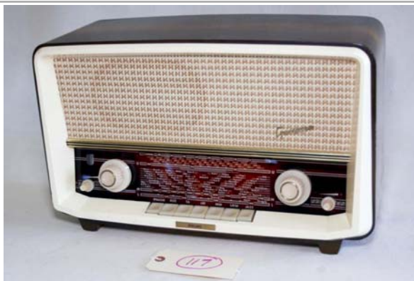
117. Philips / Gemma 393 LW/MW and FM; 1959/1960; 6-tube