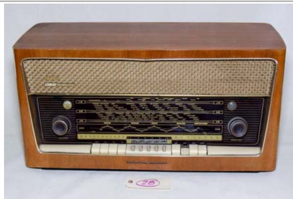
28. Grundig / 4090 BC/SW; circa 1957; 4 speakers; mfd in Germany