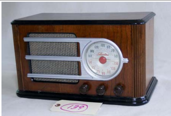
139. Silvertone / 6050 AM set; 1946; 6-tube; Coleman