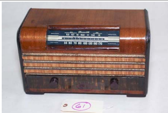
61. Farnsworth / DT-64 Pre-war; AM/SW; Wood case