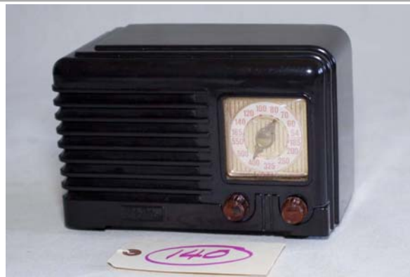
140. Fada / LW53 AM set; circa 1939; 5-tube; Bakelite case; Coleman