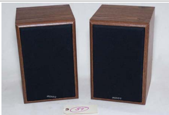
59. Advent / Bookshelf I Speaker pair; in working order Start Bid: $60