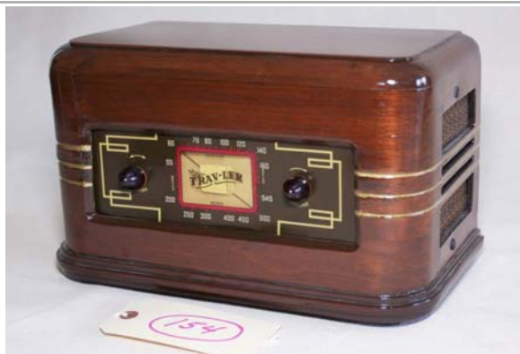
154. Trav-ler / A502 AM set; TRF; circa 1938; 4-tube; Coleman