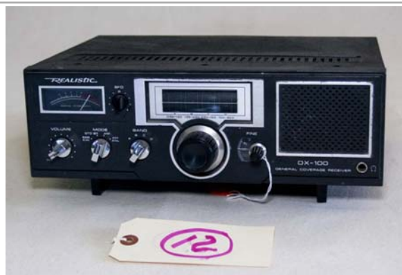
12. Realistic (Radio Shack) / DX-100 Solid-State Shortwave Receiver; 520 kHz to 30 MHz in four bands