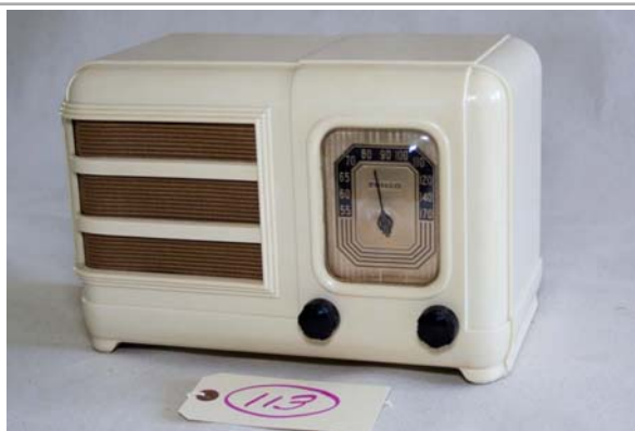
113. Philco / 38-12 AM set; 1938; 5-tube; Coleman