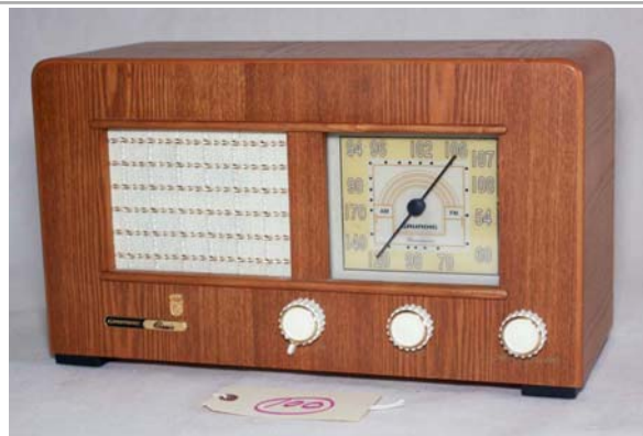
100. Grundig / AD-950 Classic Heinzelmann "Limited Edition" reproduction; circa 1995; AM/FM; mfd in Germany