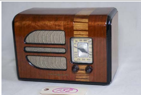
152. General Electric / GD-41A AM set; 4-tube; Coleman