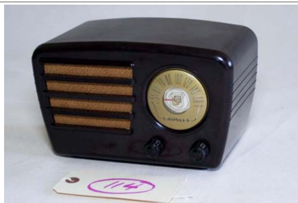
114. Crosley / 58TK AM set; 1948; 5-tube; Bakelite case; Coleman