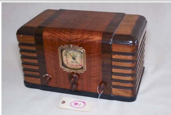
31. Sparton (Canadian) / 255A BC/SW; 1935/1935; 5-tube; Multi-tone wood case; mfd in Canada