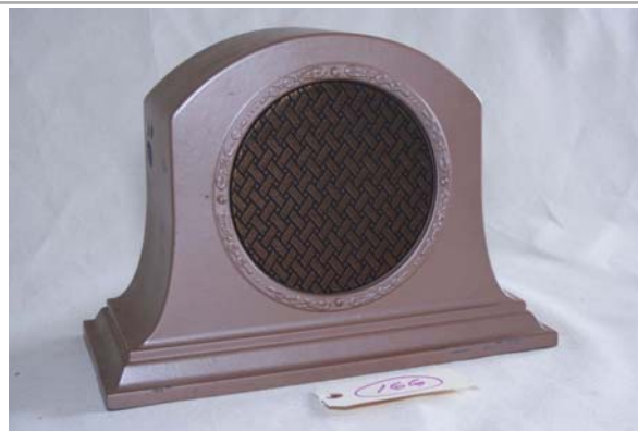
166. Radiola / 100A Speaker; has chip in case; has continuity - clicks with battery test