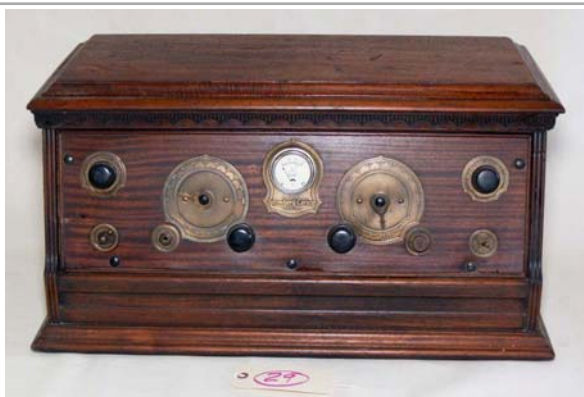
29. Stromberg Carlson / 601A Neutrodyne TRF; 1925/1926; Slant panel; Volt meter; no tubes