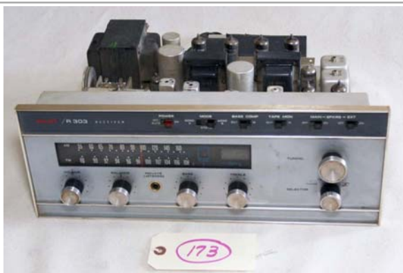
173. Pilot / R303 AM/FM Stereo Tuner/Amplifier; vintage 1960's; tested in working order