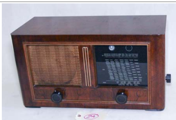
24. Mende / Super 240 LW/MW/SW; 1939/1940; 6-tube; mfd in Germany