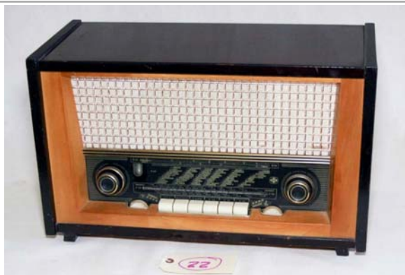
22. Emud / T7 MW/SW and FM; 1957/58; 7-tube; 3 speakers; mfd in Germany