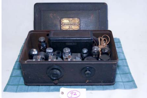
92. Atwater Kent / 40 TRF; 1928; has tubes