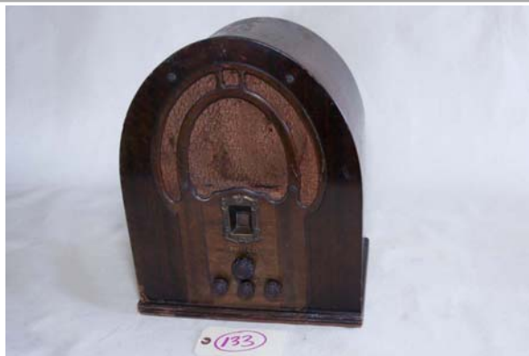
133. Philco / 89 1933/1934; Broadcast; Cathedral; Superhet; 6-tube; prior owner says it plays