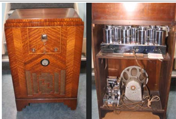
53. Scott / All-wave 15 In Lido cabinet; chrome is excellent; not working