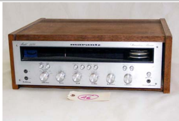
46. Marantz / 2230 AM/FM Stereo; 60 watts continuous; in working order