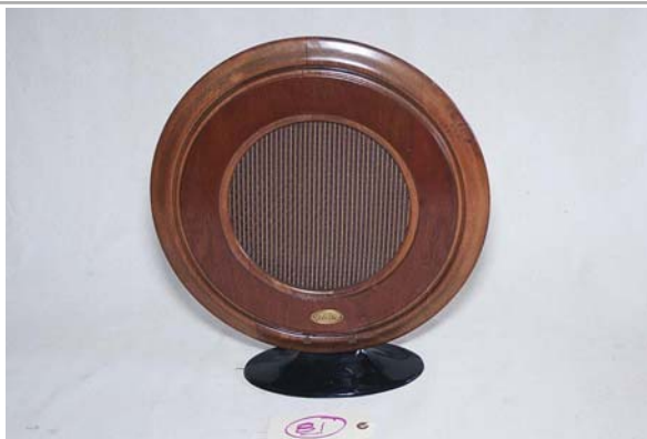
81. Rola / Re-Creator Mid 1920's speaker; has continuity - clicks with battery test