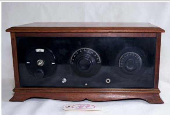
169. Homebrew custom / model? Mid 1920's; TRF; no tubes