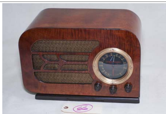
66. Stewart Warner / 1671 AM set; 1936; 5-tube; wood case; Coleman