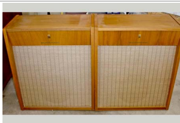
90. Grundig / model? Speaker pair; untested