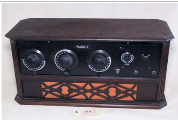
23. Marshall / 5 1920's coffin TRF set; no tubes