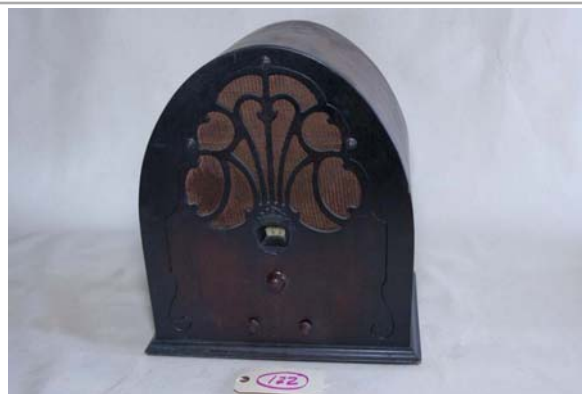
122. Philco / 20 1930; TRF; Cathedral; 7-tube