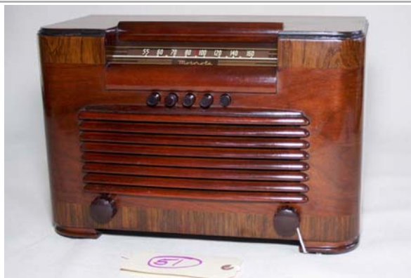
51. Motorola / 61X14 AM set; 1942; 5-tube; push-button tuning