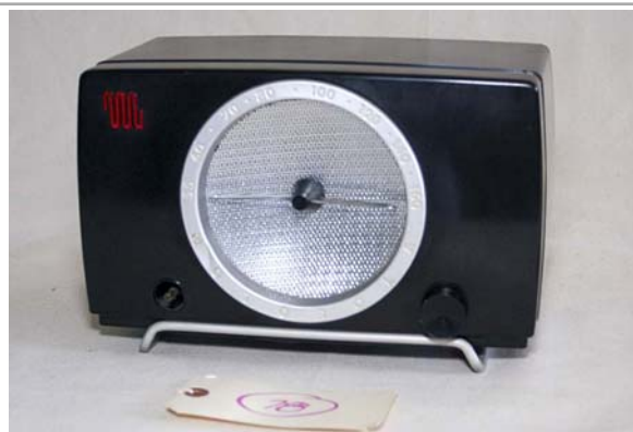
78. Motorola / 5X13U AM set; 1950; 5-tube; classic style; Coleman