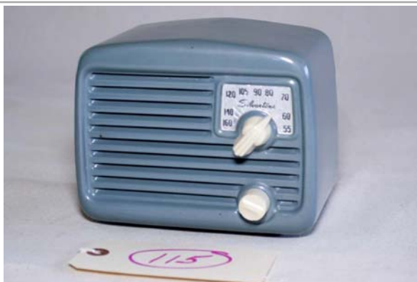
115. Silvertone / 8003 AM set; 1948; 4-tube; metal case; Coleman