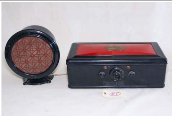
21. Atwater Kent / 55 TRF; 1929; Includes speaker