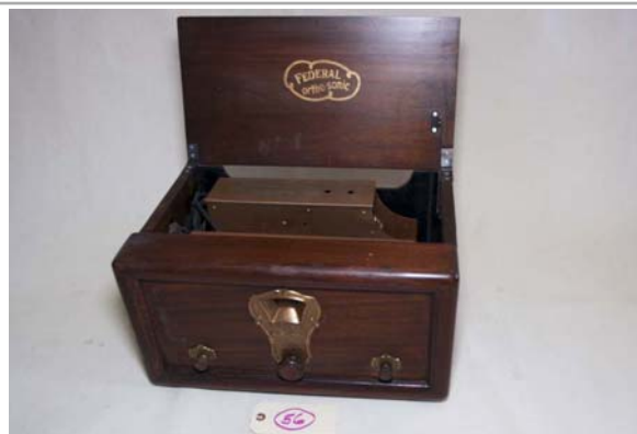
56. Federal / OrthoSonic type H 1928; TRF; no tubes Start Bid: $120