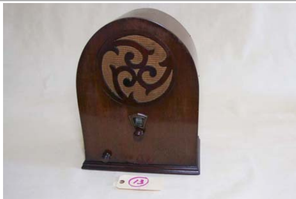
13. Syrene / model? Early 1930s; TRF; Cathedral Radio