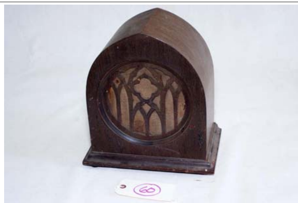
60. Peerless / model? 1920's Cathedral Speaker Start Bid: $25