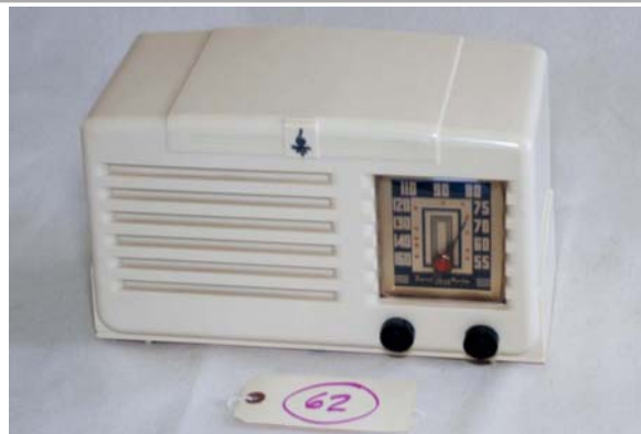
62. Emerson / 9LW-344-2 Pre-war; Bakelite case; Plaskon; Coleman