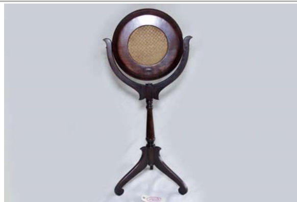
160. Dixie / model? Mid 1920's speaker; floor standing; has continuity - clicks in battery test