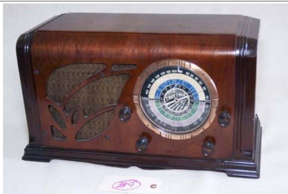
39. Truetone / D-723 BC/SW; 1937; 7-tube; multi-colored dial to match pre-war broadcast network colors