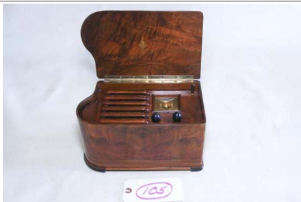
105. Emerson / AX-238 Ingraham "Jewel Box" case; 1938; 5-tube