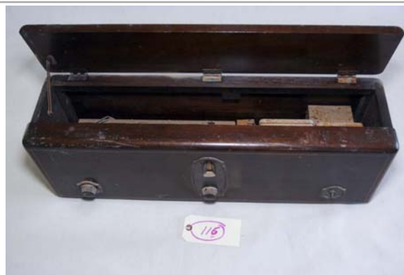
116. Radiola / 18 1928; AC power; TRF; 7-tube; no tubes