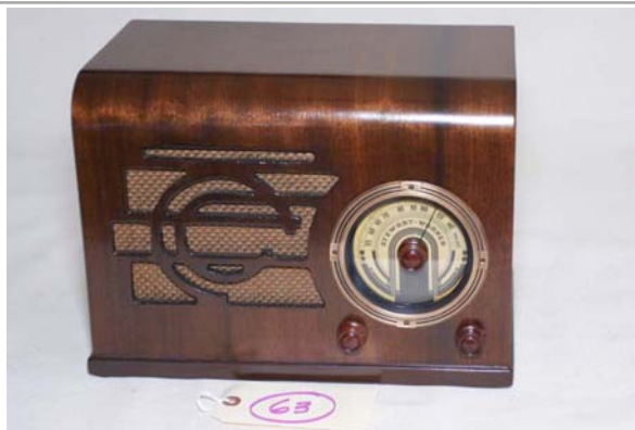
63. Stewart Warner / R144-1 AM set; 1936; 5-tube; wood case; Coleman