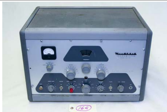
164. Heathkit / DX-100 Transmitter; 100 watt input; tested quickly - outputs RF, appears to modulate