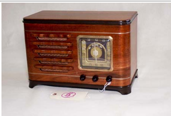
5. Unknown / 47-155 BC/SW; Distinctive dial; Coleman