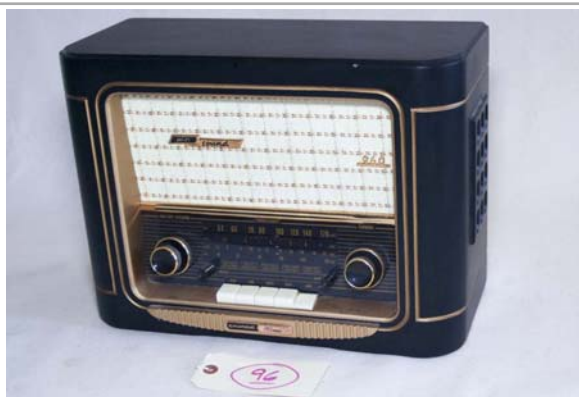
96. Grundig / 960 Classic AM/FM/SW; circa 1999; Anniversary reproduction; mfd in Germany