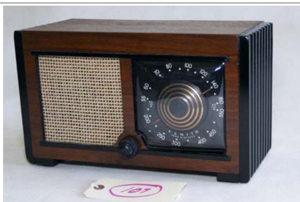
107. Zenith / 5D027 AM set; 1946; 5-tube; Coleman