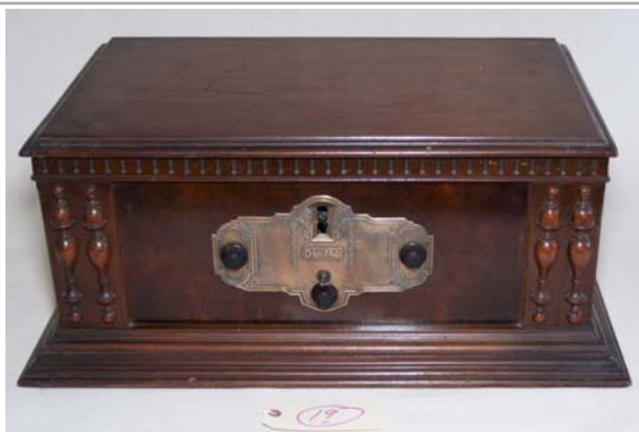
19. Day Fan / 25 Late 1920's; Cabinet only - no chassis