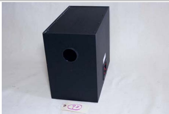
93. Advent / Subwoofer In working order