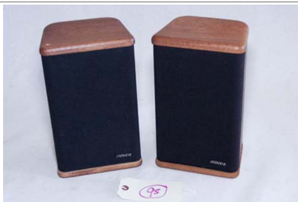
95. Advent / Mini Speaker pair; in working order