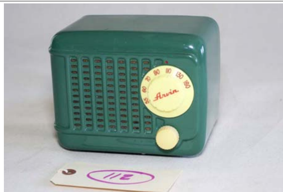
112. Arvin / 243T AM set; 1948/1949; 4-tube; metal case; Coleman