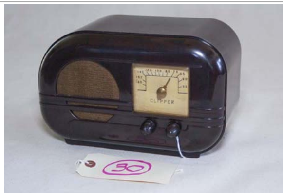
30. Clipper / model? AM set; 1940s; Bakelite case; Coleman