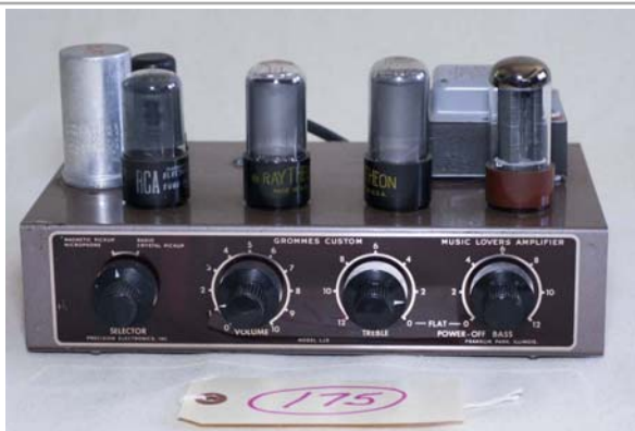
175. Grommes / LJ2 "Little Jewel" "Music Lovers Amplifier" ; 10 watts; circa 1959