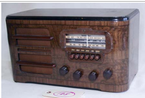
125. Motorola / 61C BC/SW; 1939; 6-tube; push-button tuning; Coleman