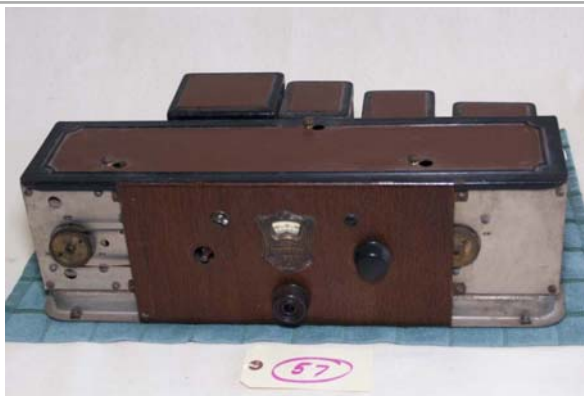
57. Atwater Kent / 60 TRF; 1929; Chassis only; no tubes Start Bid: $65