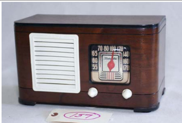
157. Motorola / 51X19 AM set; 5-tube; Coleman