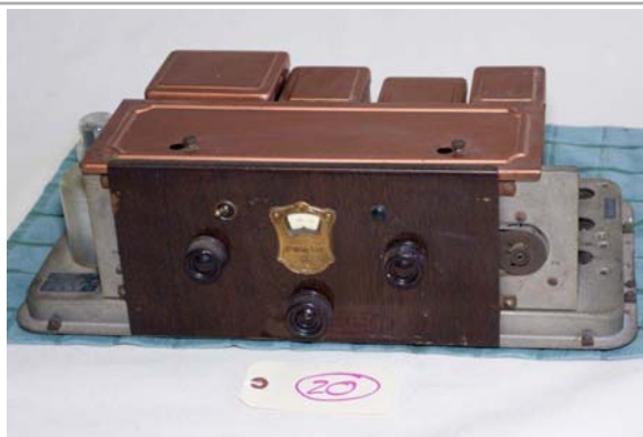
20. Atwater Kent / 55 Chassis only; TRF; 1929; missing 3 tubes