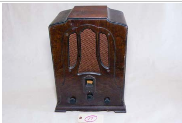
17. RCA / Superette R-7-A Superhet; circa 1932; 8-tube; Tombstone