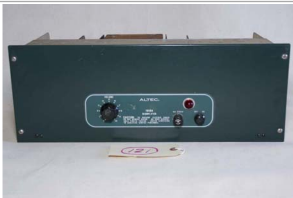
121. Altec / 1609A Bi-amplifier