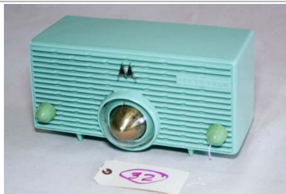
32. Motorola / 56H (Green) AM set; circa 1955; 5-tube; unique "Bullet" dial; Coleman