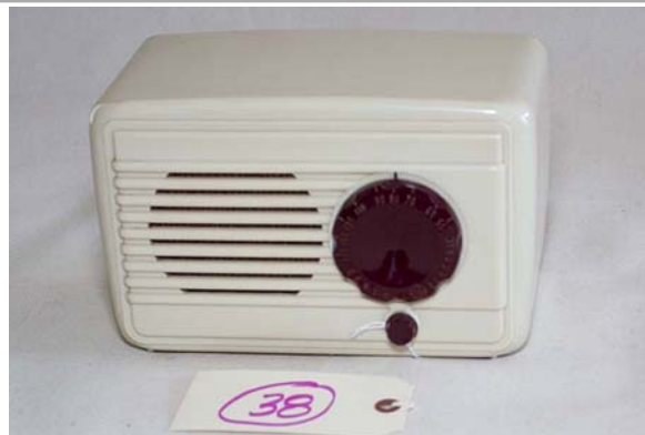
38. General Electric / C402 AM Set; Post-war; Plaskon; Coleman