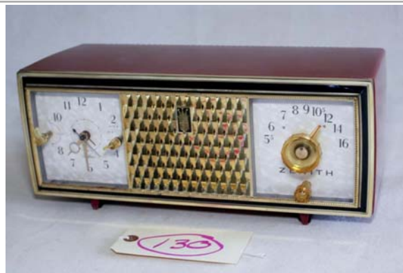
130. Zenith / C520V AM clock radio; 1960; 5-tube; Coleman