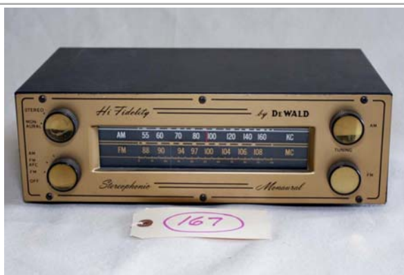
167. DeWald / M-1000 AM/FM Stereo Tuner; 1959