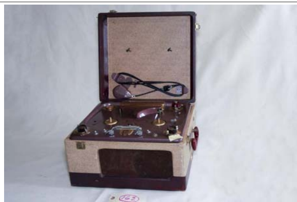
162. Webcor / 210-1B Reel-to-reel tape recorder; 2 speed