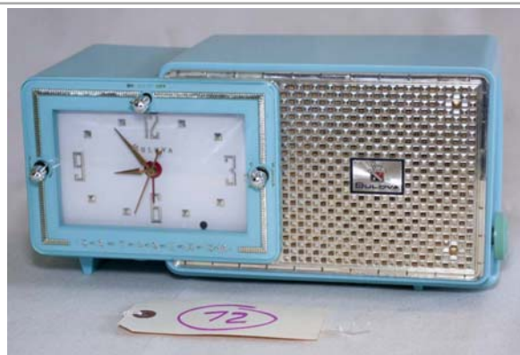
72. Bulova / 120 AM Clock Radio; Turquoise & Gold; Coleman