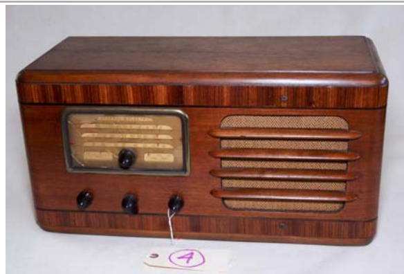
4. General Electric / F-70 AM/SW; 1937; 7-tube; wood case