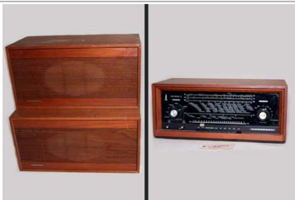
55. Tandberg / Huldra 8-55 LW/MW/SW; 1965; mfd in Sweden; tuner/amp untested; includes 2ea working model 112-7 speakers Start Bid: $100