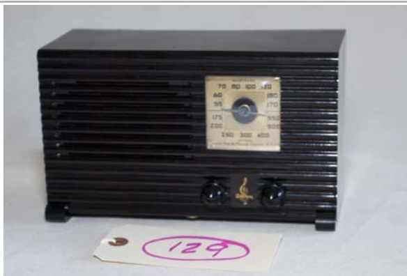
129. Emerson / AX-211 "Little Miracle"; AM set; 1938/1939; 5-tube; Coleman