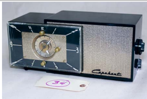
34. Capehart / TC-62 AM Clock Radio; 6-tube; Coleman