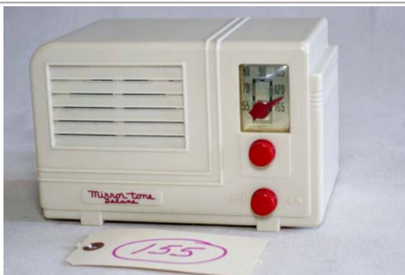
155. Mirror Tone / Deluxe 850 AM set; 4-tube; Coleman