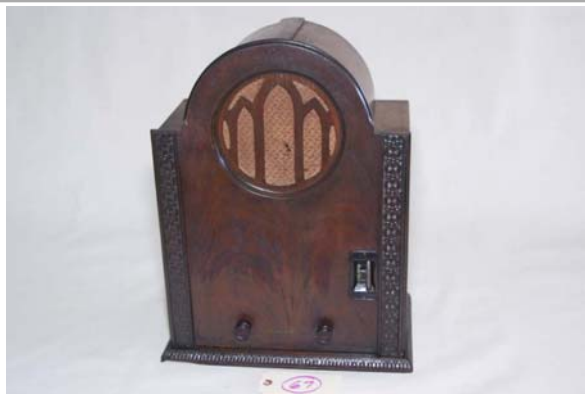
67. Unknown Early 1930s; TRF; Cathedral Radio