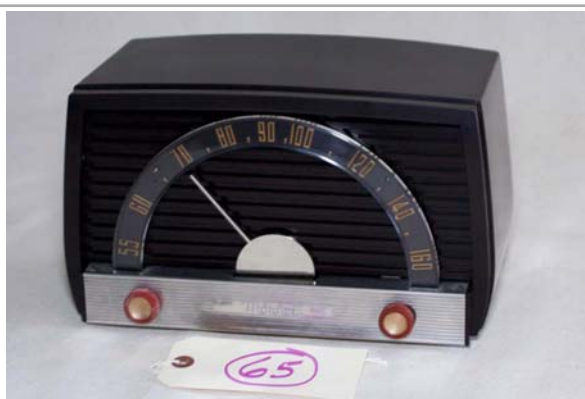
65. Motorola / 59X AM set; 1950; 5-tube; classic style; Coleman