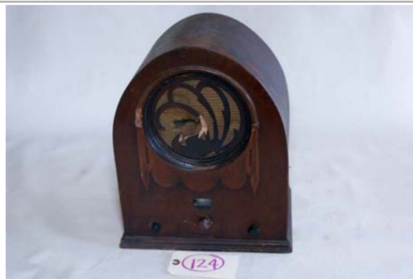
124. Jackson Bell / 62 "Swan" 1930; Cathedral; Neutrodyne TRF; 6-tube