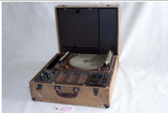
163. Meissner / 9-1065 Record Recorder/Player and PA system