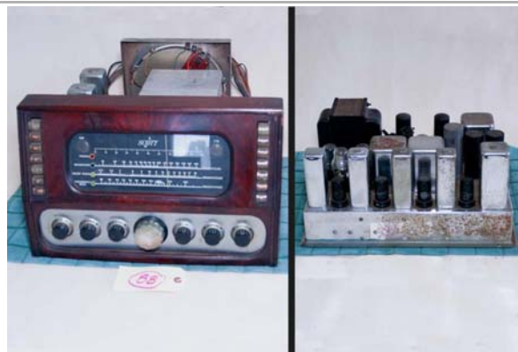
88. Scott / 800b Receiver chassis and PS/amplifier chassis; in working order