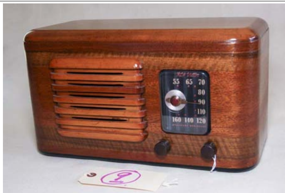
9. RCA Victor / 46X3 AM set; 1939; 5-tube; wood case; Coleman