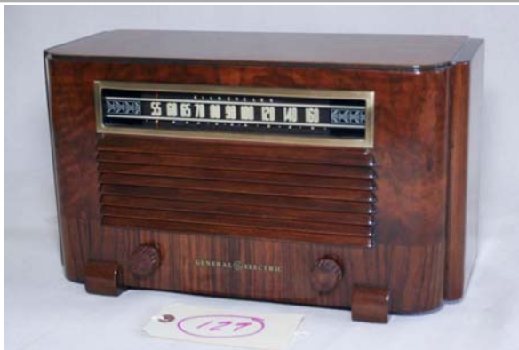
127. General Electric / J53 AM set; 1940; 5-tube push-button tuning; Coleman