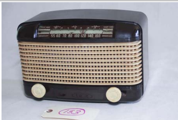
153. Farnsworth / ET-060 BC/SW; 1946; 6-tube; Coleman