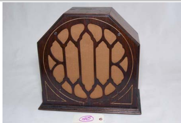
40. Unknown 1920s speaker; octagonal styling