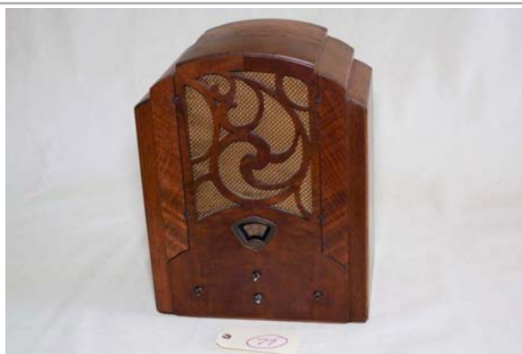
77. Stewart Warner / R1251A AM set; 1934; Superhet; 5-tube; Tombstone