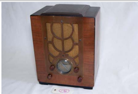
176. Silvertone / 1805A BC/SW; 1935; 7-tube; electronically restored in working order