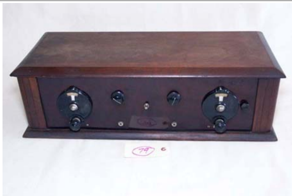
79. Unknown Mid 1920s TRF battery radio; no tubes