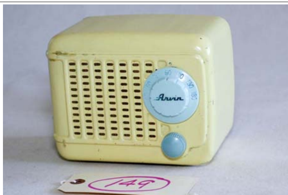
149. Arvin / 242T AM set; 1948/1949; 4-tube; metal case; Coleman