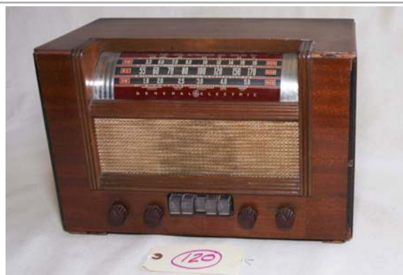
120. General Electric / L740 "Deluxe Beam-a-Scope"; BC/SW; 1941/1942; 7-tube; push-button tuning