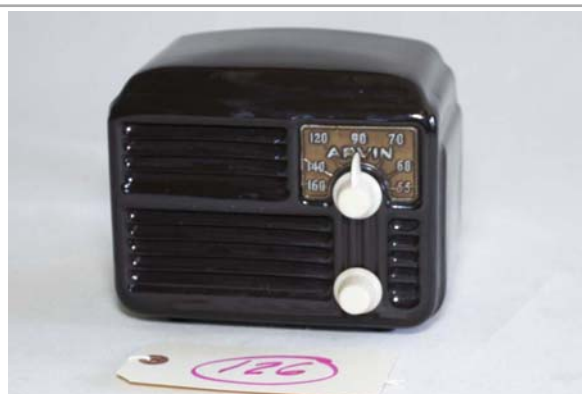
126. Arvin / 444 AM set; circa 1947; 4-tube; metal case; Coleman