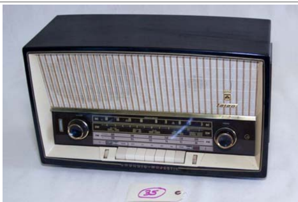
35. Grundig / 2120 BC/SW; circa 1961; mfd in Germany