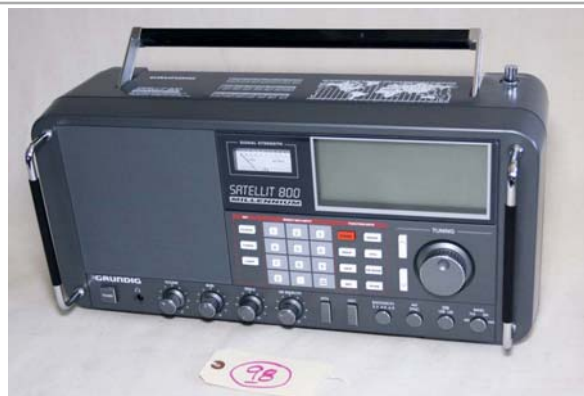
98. Grundig / Satellit 800 Millennium AM/FM/VHF/Continuous SW; Dual Conversion; SSB