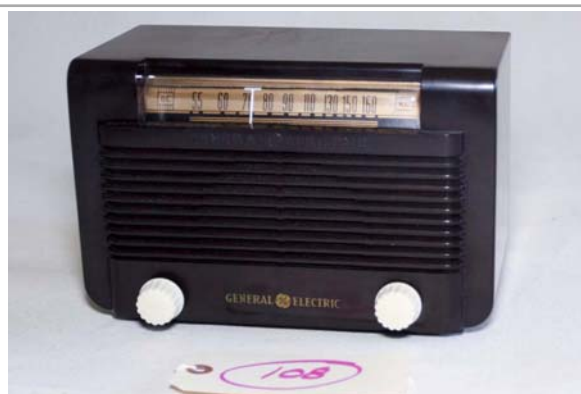
108. General Electric / CL-500 AM set; 1946/1947; mfd in Canada; 5-tube; Coleman