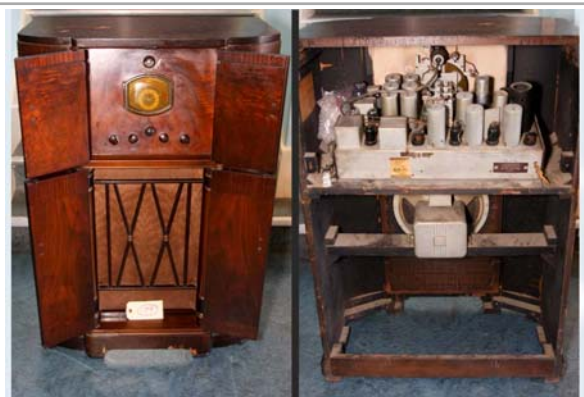
179. RCA / C-15-3 BC/LW/SW; 1935; 15-tube; console