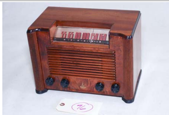
76. Emerson / 467 Ingraham case; 1941 or 42; 5-tube; Coleman