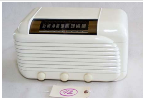
42. Stewart Warner / B61T1 AM set; 1949; 6-tube; Bakelite case; Coleman