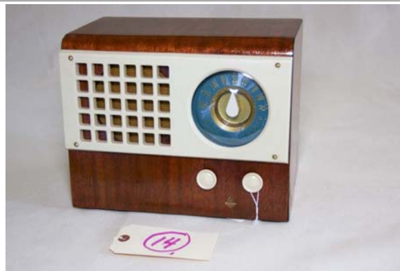
14. Emerson / 504 Wood case; 1946; 5-tube; Coleman