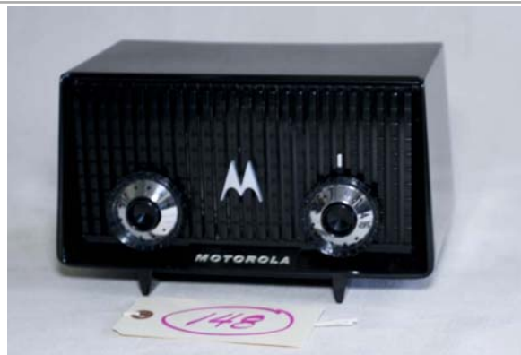
148. Motorola / 56R AM set; circa 1955; 5-tube; Coleman