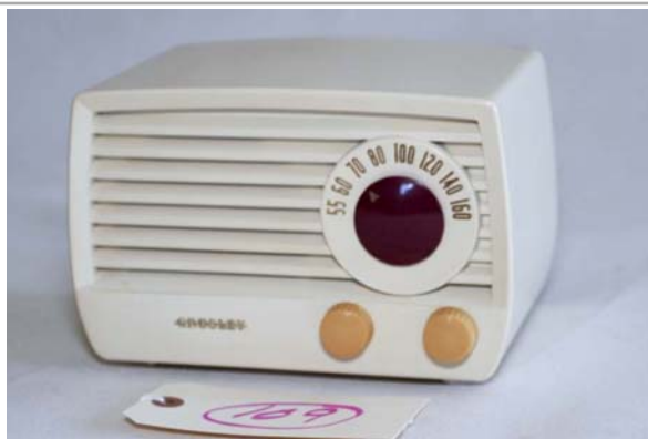
109. Crosley / 10-104W AM set; 1950; 5-tube; Coleman