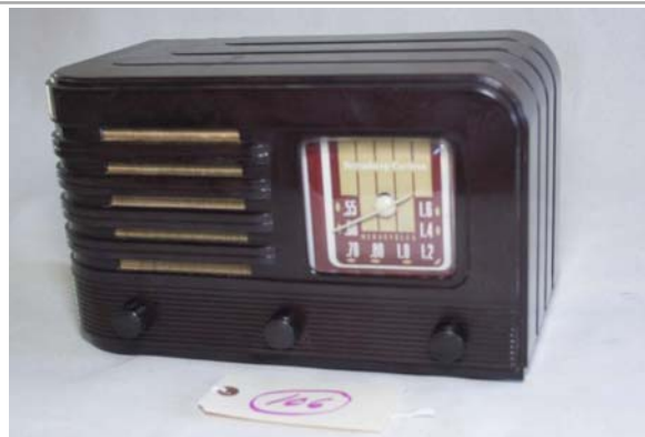
106. Stromberg Carlson / 561 AM set; 1946/1947; mfd in Canada; 6-tube; Coleman