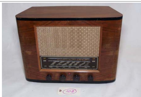
102. Ferranti / 225 LW/MW/SW; 220V; mfd in Great Britain; circa 1950; 5-tube