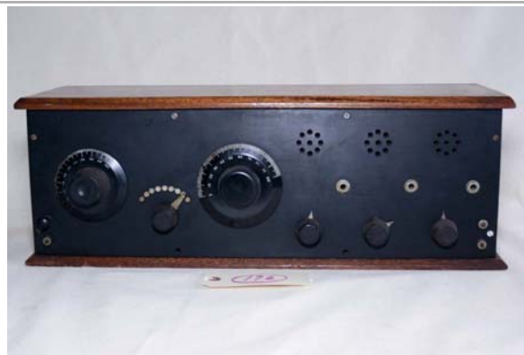
172. Homebrew custom / model? Mid 1920's; TRF; no tubes