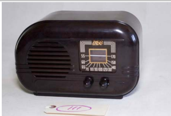
111. UEC / model? AM set; 1942-1946; 5-tube; Bakelite case; Coleman