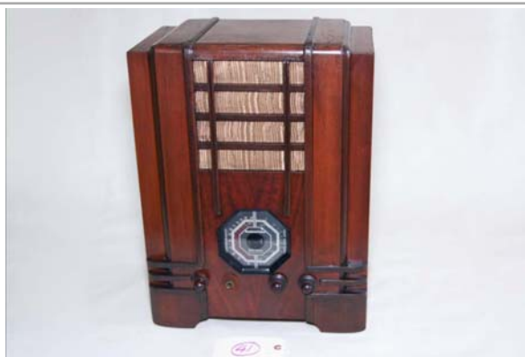
41. Stromberg Carlson / 130-U BC/SW; 1936; 7-tube; Tombstone