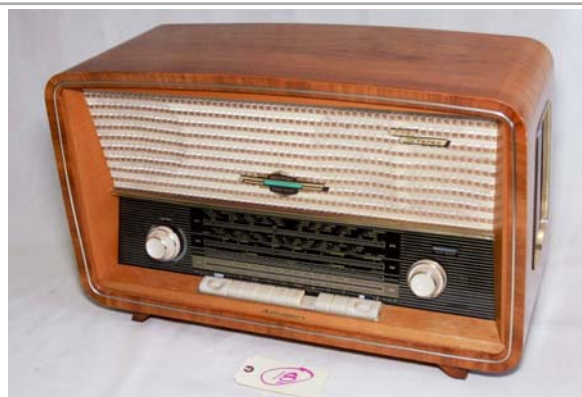
18. Korting / 1085FX "Delmonico Stereomatic"; LW/MW/SW and FM; circa 1963; 4 speakers; mfd in Germany