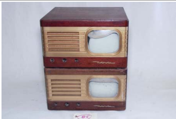
85. Motorola / VT 71MA Lot of Two 7" BW TV's; 1948