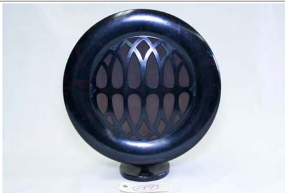
159. TEFAG / model? Mid 1920's speaker enclosure; no driver