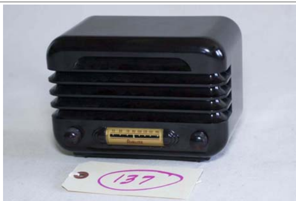
137. Airline / model? AM Set; Bakelite case; Coleman