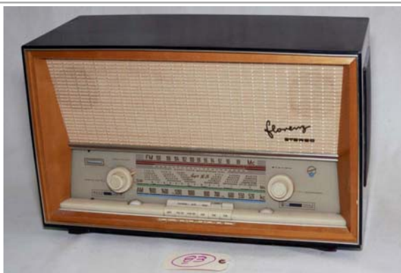
83. Blaupunkt / 21353 "Florenz Stereo" "Florenz Stereo"; Circa 1962; MW/SW and FM; 7-tube; mfd in Germany