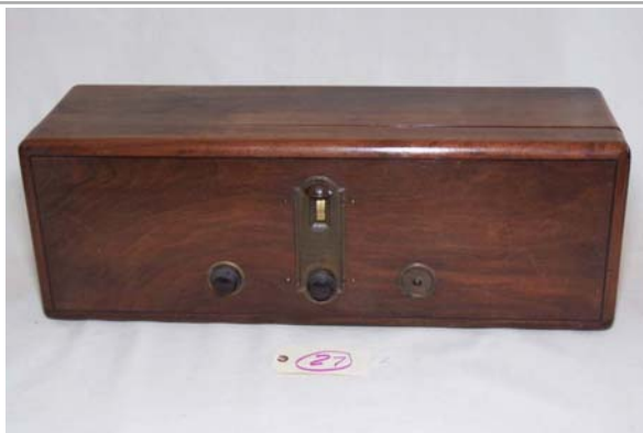
27. Canadian Westinghouse / model? Circa 1928; AC set; missing some tubes; mfd in Canada