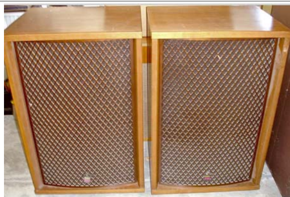
82. Sansui / SP-5500 Speaker pair; tested in working order