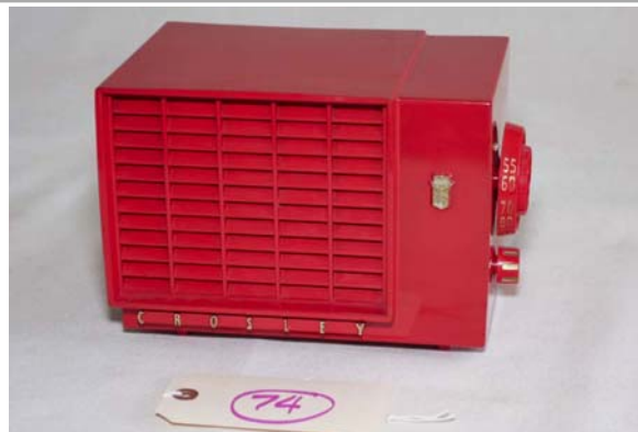
74. Crosley / F-5 "The Graduate" AM set; 1953; Red plastic; Coleman