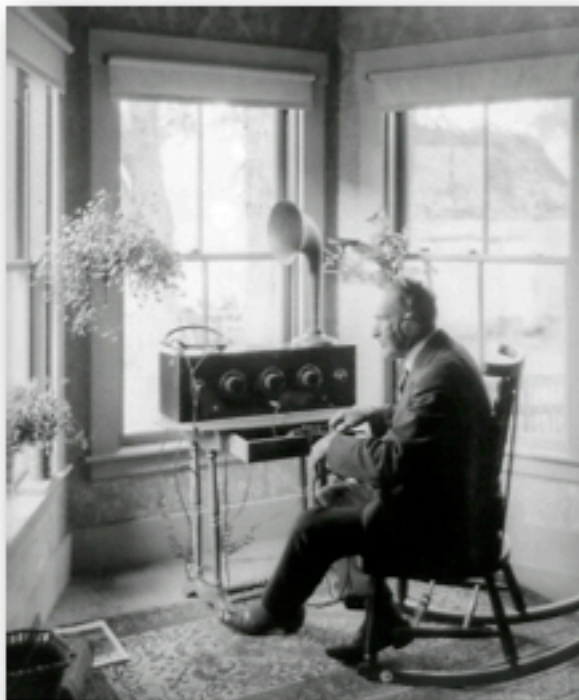
Window to the world