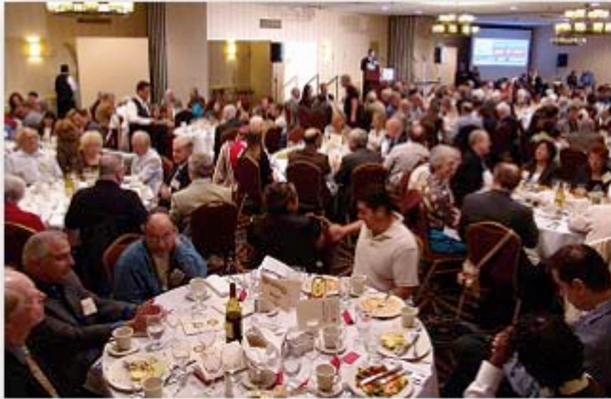
A Bay Area Radio Hall of Fame award ceremony in Emeryville