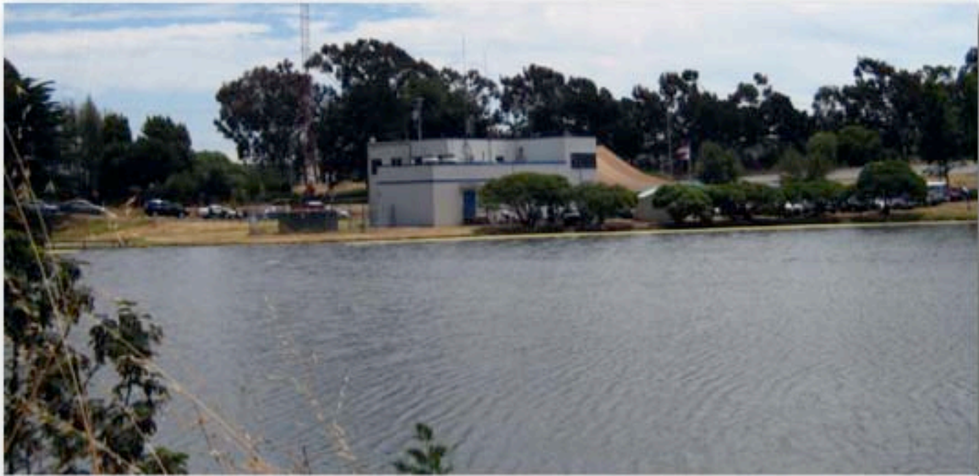
Beautiful weather for our bash on the shore of "Lake KRE"