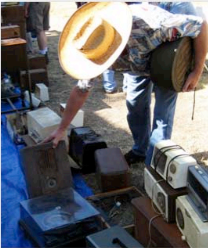
Diamonds in the rough to be found in the flea market sales section