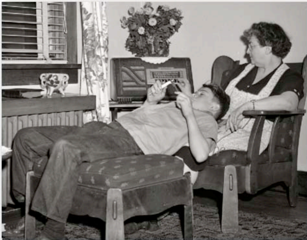
1943 TV without pictures