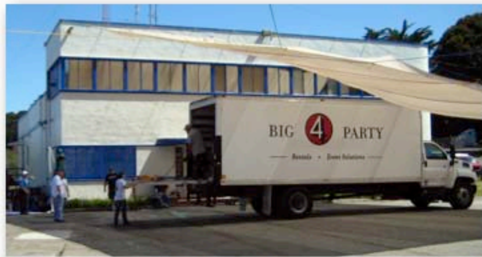
The chairs and stage arrive on Friday