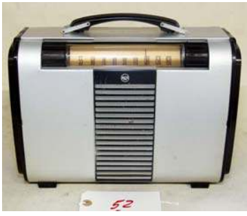
52. RCA / BP-6 1946/1947; Broadcast band