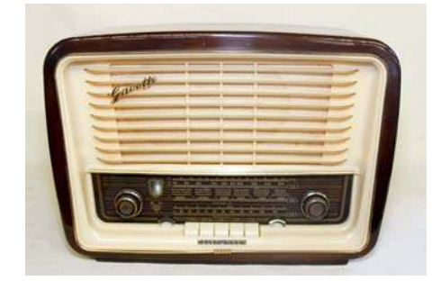
2. Telefunken / Gavotte 7 1956/1957; BC/SW/FM; not working