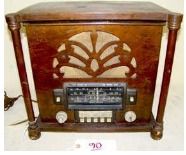
90. Zenith / 7S434 1939; BC/SW; electronically restored

89. General Electric / K-43 1933; Broadcast band; works