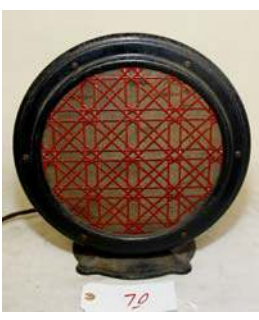
70. Atwater Kent / F2? 1929; Speaker