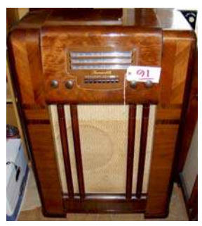
91. Farnsworth / AC-70 1940; BC/SW; electronically restored