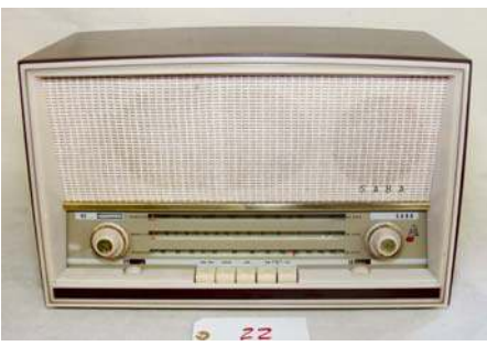
22. Saba / 90/11K 1961/1962; BC/SW/FM