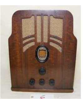
6. Philco / 610B 1935; BC/SW