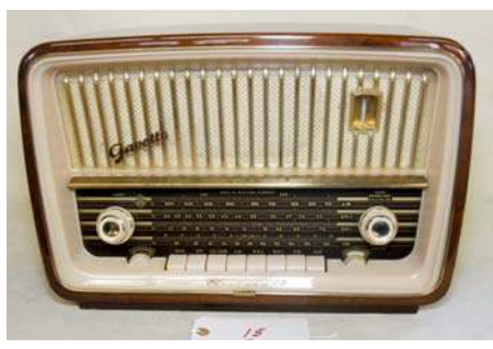
15. Telefunken / Gavotte Circa 1956/1957; BC/SW/FM; works

13. Zenith / X405V Circa 1955; Broadcast band; works