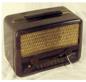
63. Sentinel / 335P 1950; Broadcast band; tube portable

61. Stromberg Carlson / 1101 Series 13E 1946; Broadcast band