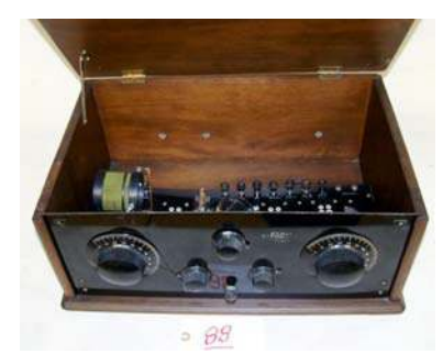
88. Viking / Junior Circa 1926; TRF; no tubes