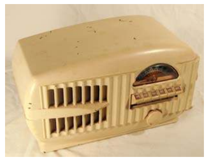
73. Belmont / 6D121 1847; Broadcast band; electronically restored