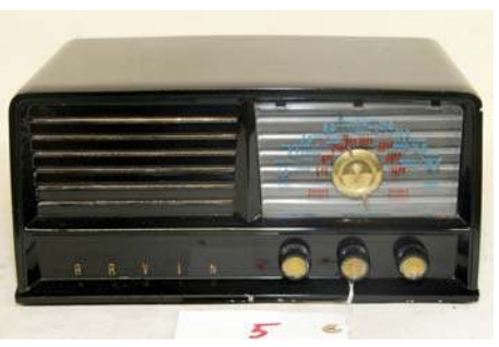
5. Arvin / 6555T 1952/1953; BC/SW