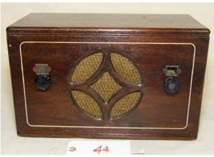
44. American Bosch / 5A 1931; Broadcast band