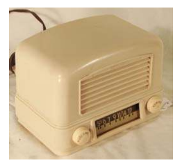
76. Airline / 74BR-1502B1947; Broadcast band; electronically restored

74. Emerson / 642A 1950; Broadcast band; electronically restored