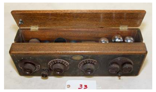
33. Atwater Kent / 331927; TRF; Broadcast band; has tubes