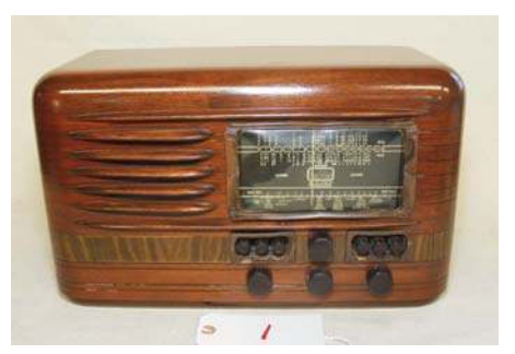
1. Packard Bell / 48 Circa 1939; BC/SW