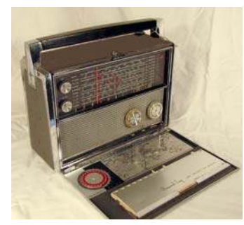
84. Admiral / 909A All World 1959; BC/LW/SW; solid state

82. Sylvania / 512RE 1951; Broadcast band; electronically restored