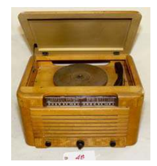
48. Packard Bell / ? Late 1940s; Broadcast band, 78 rpm phono