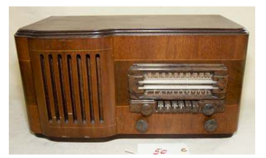
50. Wards Airline / 14BR-685A 1941; BC/SW; electronically restored

49. Philco / 60B (first version) 1933/1934; Broadcast band