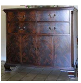
94. Scott / 800B 1946; BC/SW/FM; cabinet and electronics restored