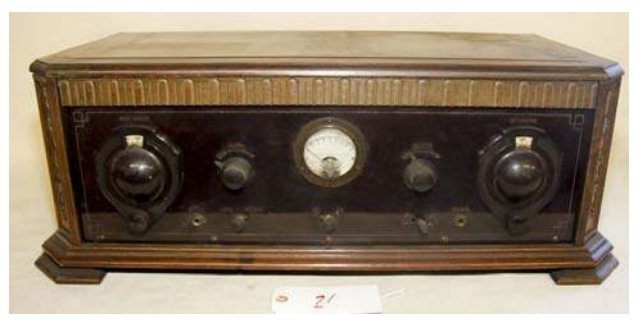
71. Unknown / 1925ca Superheterodyne?