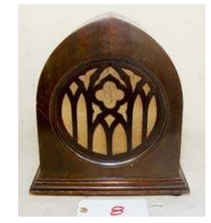
8. Peerless ? / P ? Circa 1928; Speaker