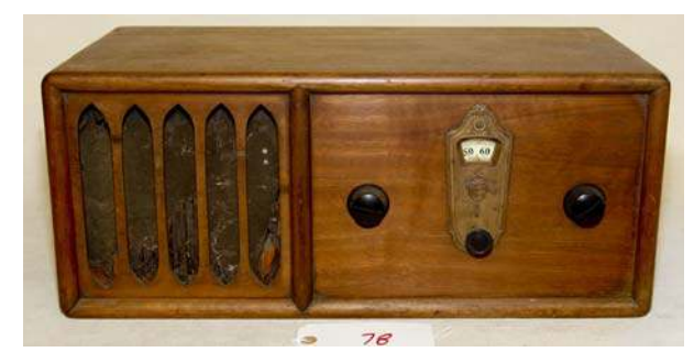
78. Kemper / Kompak K56 1928; Broadcast band