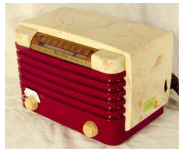
64. Bendix / 115 1948; Broadcast band