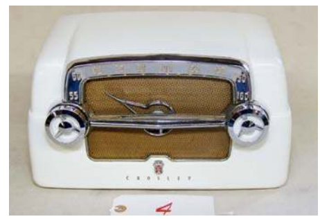
4. Crosley / E-15WE 1953; Broadcast band; works