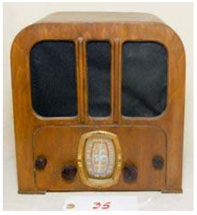
35. Crosley / 516 1935/1936; Broadcast band