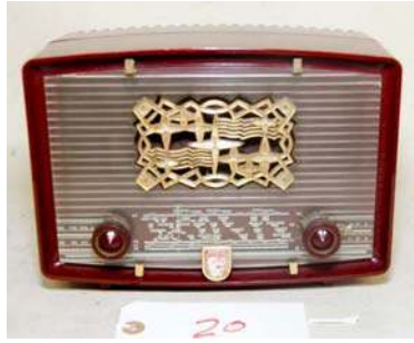
20. Philips (France) / BF151U 1955; BC/SW; electronically restored

18. Crosley / 515 Fiver 1935; Broadcast band