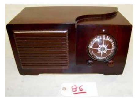
86. Automatic / 612 1946; Broadcast band