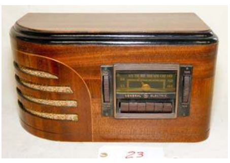
23. General Electric / H624 1939; BC/SW

21. Westinghouse / H125 Little Jewel Refrigerator 1945/1947; Broadcast band