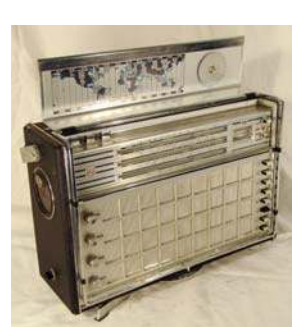
85. Philips Norelco / L6X35T/54 1967; BC/LW/SW; solid state