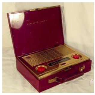
67. General Electric / 145 1948ca; Broadcast band; AC/DC