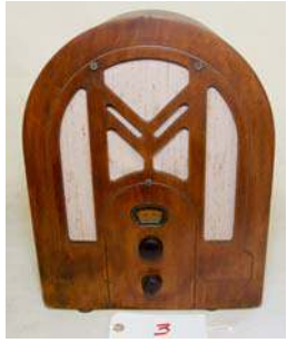
3. RCA / 4T 1936; Broadcast band; electronically restored