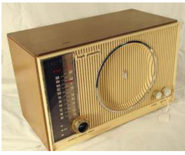
59. Zenith / H845 Super Interlude 1964; AM/FM; works