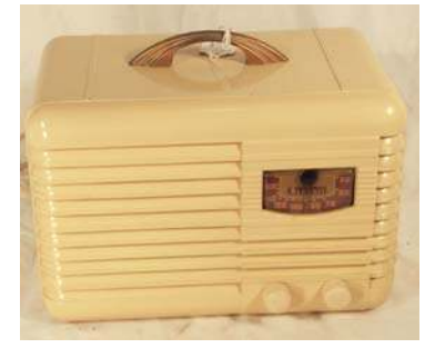
79. Sentinel / ? 1941ca; Broadcast band; electronically restored