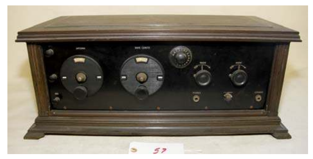
57. Unknown / . 1925ca; TRF