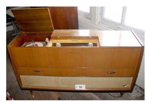
56. Grundig / SO 190U Circa 1960; BC/SW/FM; has phono; radio slightly distorted, phono works