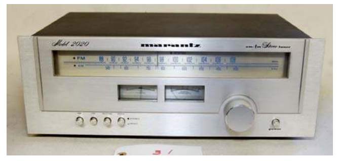
31. Marantz / 2020 AM/FM Tuner