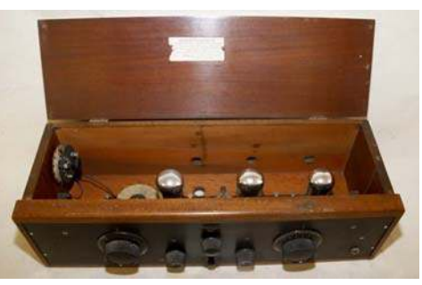
29. Crosley / Tridyn 3-R3 1924; regenerative; has tubes

27. Arvin / 417 Rhythym Baby 1936/1937; Broadcast band; electronically restored