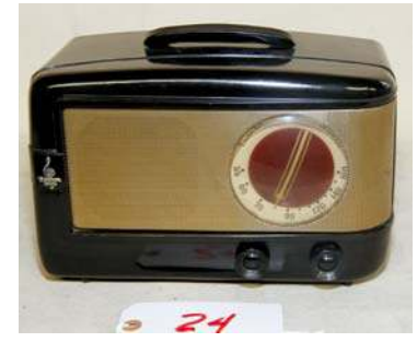
24. Emerson / 513 1948; Broadcast band