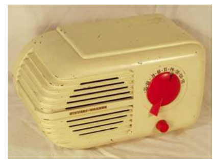
80. Stewart Warner / 07-513H1939; Broadcast band; electronically restored