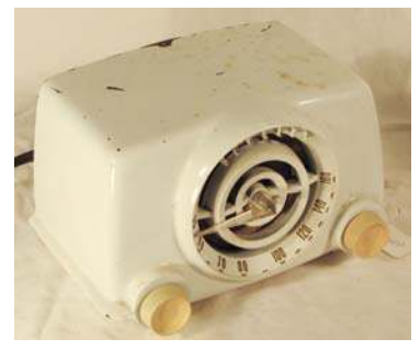
75. Crosley / 11-100U 1951; Broadcast band; electronically restored