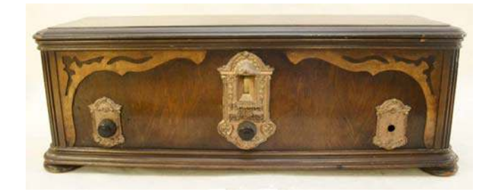
40. Brunswick / 5NO1928; Superheterodyne; broadcast band; has tubes