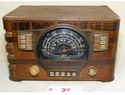
39. Zenith / 7S529 1940/1941; BC/SW