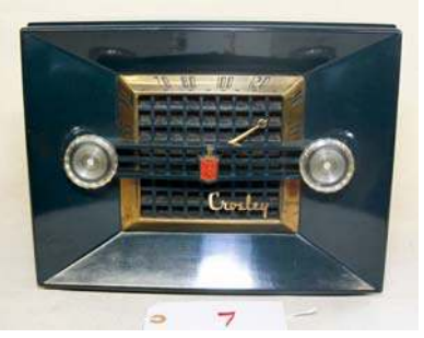
7. Crosley / E20 1953; Broadcast band