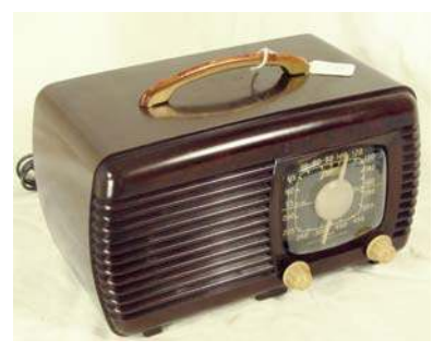
55. Zenith / 6D520 1941ca; Broadcast band; works