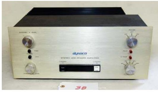
38. Dynaco / 400 Stereo power amplifier