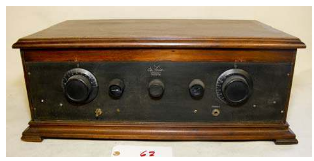
62. Crosley / Deforest Trirdyn 1925; TRF; Broadcast band