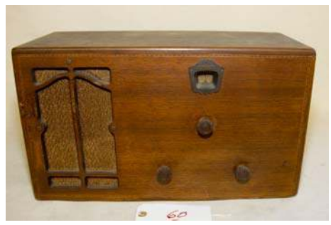
60. Philco / 52C 1932/1933; Broadcast band